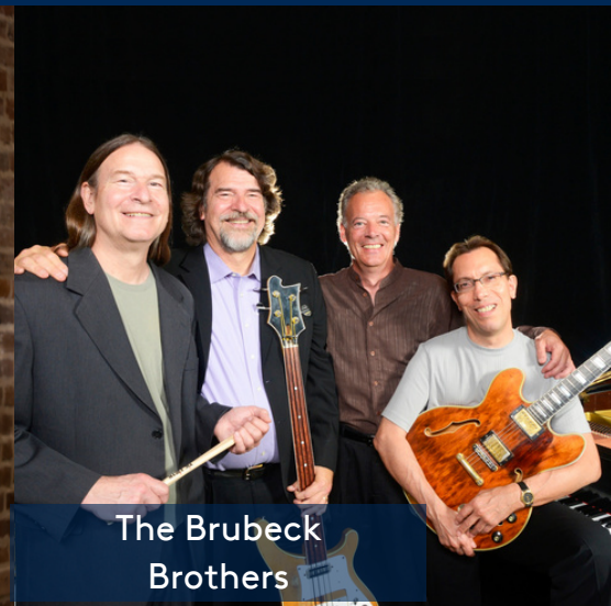
The Brubeck Brothers