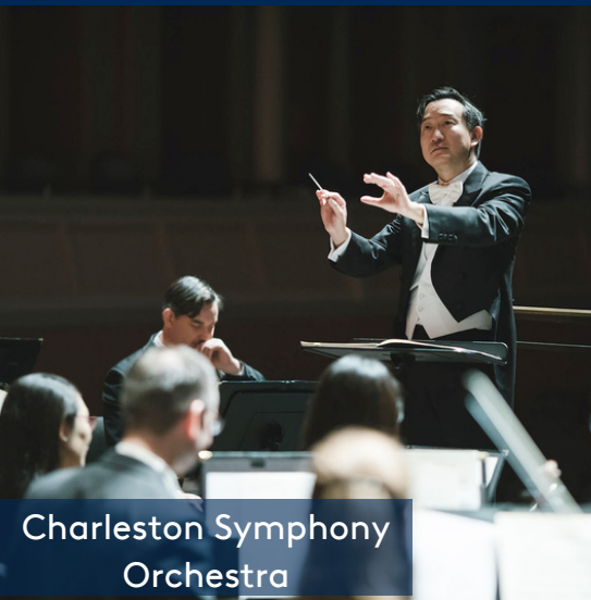
Charleston Symphony Orchestra